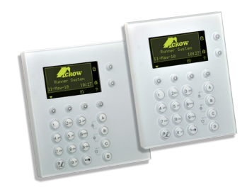
FW-KEYPADS 2 Way Wireless Graphic Keypads